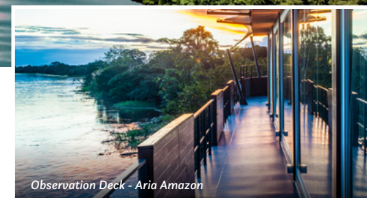
Observation Deck - Aria Amazon