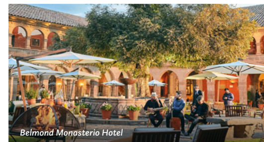
Belmond Monasterio Hotel