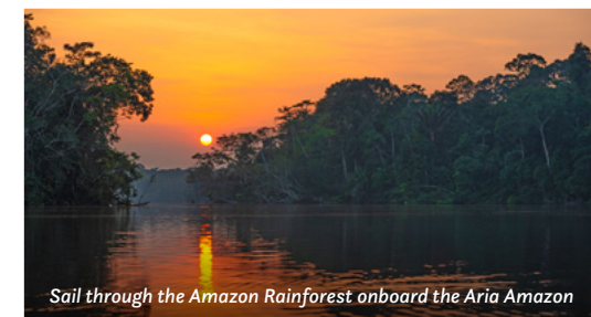
Sail through the Amazon Rainforest onboard the Aria Amazon