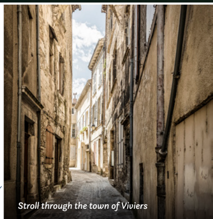
Stroll through the town of Viviers